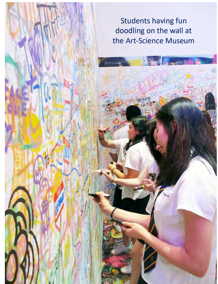
Students having fun doodling on the wall at the Art-Science Museum