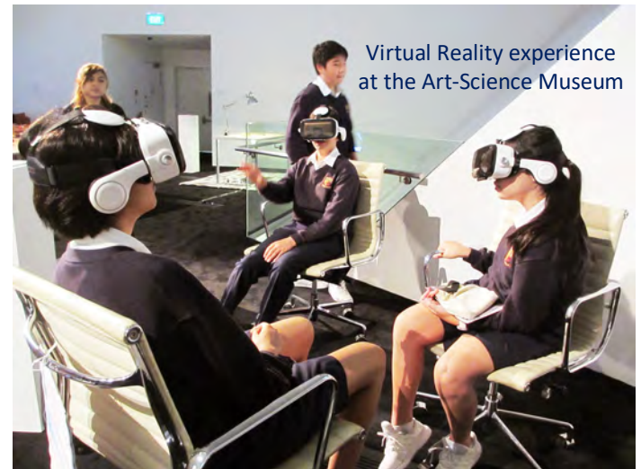
Virtual Reality experience at the Art-Science Museum

On this day, the students discovered for themselves how the performing arts comes together; from individual performing arts forms (Art - as seen in the designing and making of the paper puppets, Drama - as seen in creating and acting out the stories for the shadow puppet play and Music - as seen in learning and performing Gamelan music to accompany the drama) to being a united and collaborative informal musical theatrical production.