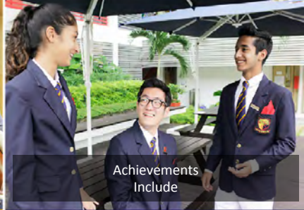
Building Through Belief, this school of choice provides