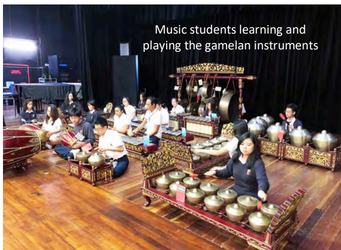
Music students learning and playing the gamelan instruments