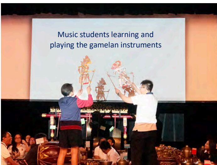
Music students learning and playing the gamelan instruments